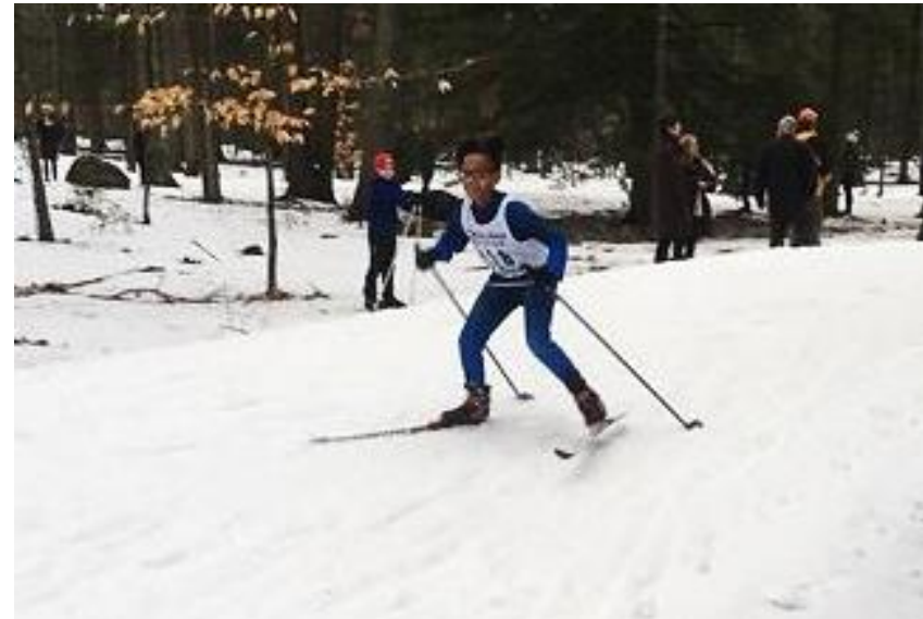
Cross-country Skiing at Pineland

There are three land trusts with large holdings in New Gloucester: the Royal River Conservation Trust, the Maine Woodland Owners, and the New England Forestry Foundation. RRCT