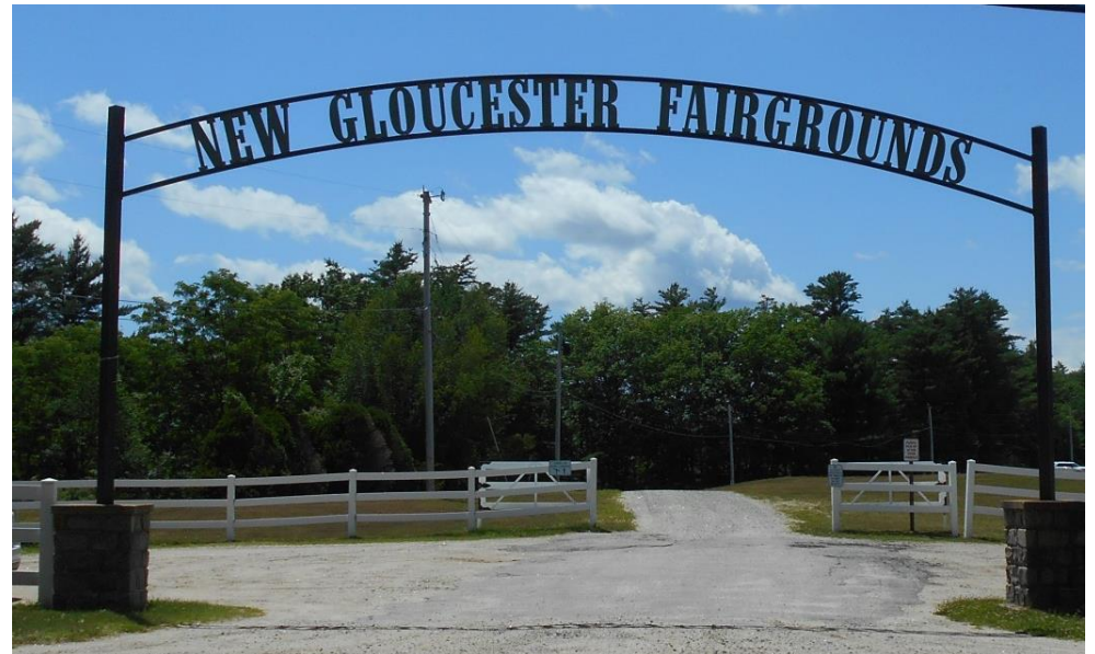
New Gloucester Fairgrounds Entrance

The town has a fulltime recreation director who oversees the recreation programming and use of town facilities. The Community Building at the municipal complex houses the Parks and Recreation Department and hosts indoor programming year-round. Indoor programming is limited by the space available in the community building. The town works with local non-profits and neighboring towns to offer recreational and educational programming for all ages from youth athletics to senior bus trips.