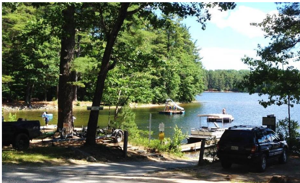
Sabbathday Lake at Outlet Beach

New Gloucester is home to the Royal River Riders, an active and long standing snowmobile club. The club maintains and grooms